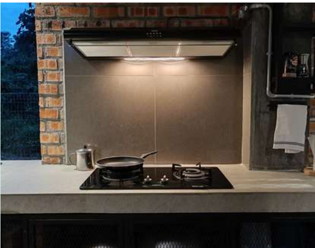
Double gas hob