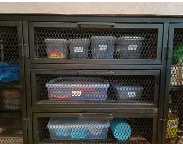
Utensils placed in secured containers