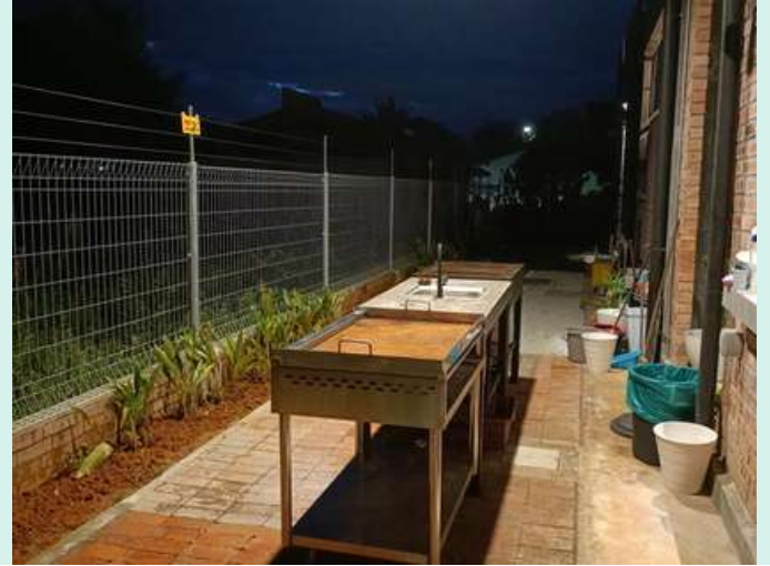
BBQ Area at night