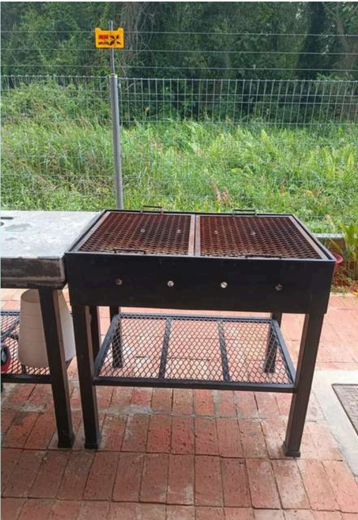
Charcoal barbecue. Please BYO charcoal & clean before use.