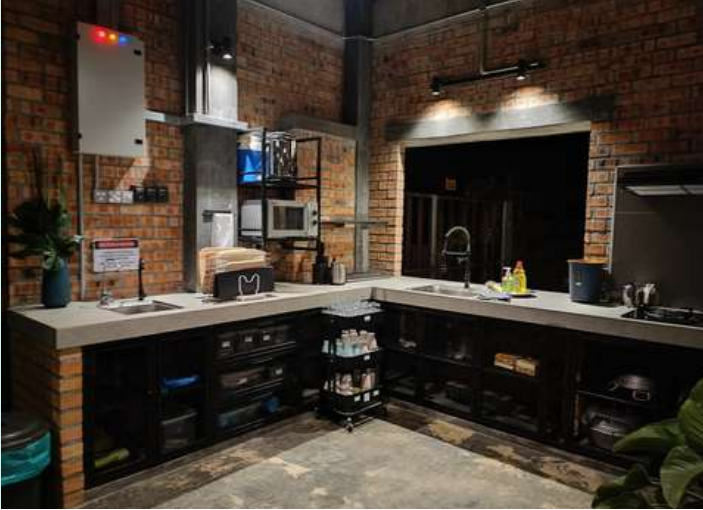
Kitchen sink open area