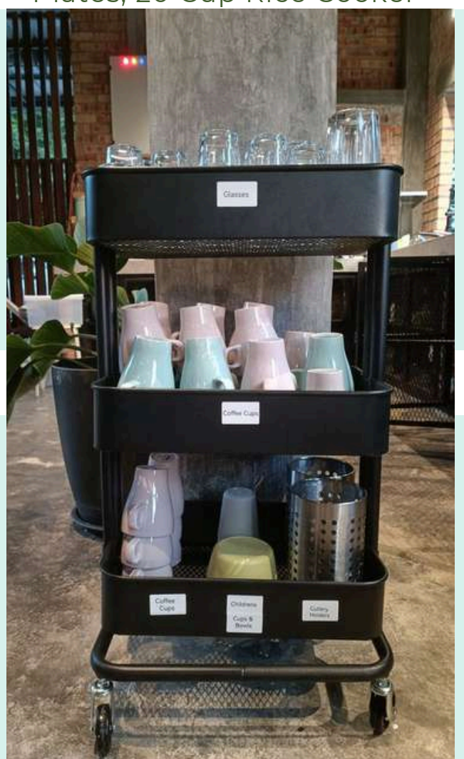
Glasses, Coffee Cups, Childrens tableware, Cutlery Holders