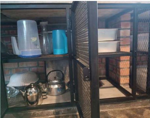
Teapots, Serving Bain Maries with cover