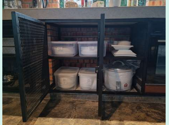
Dinner Plates, Soup Bowls, Deep Plates, 20 Cup Rice Cooker