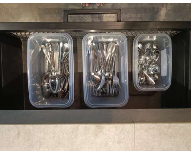
Forks/Spoons/Teaspoons/Steak Knives/ Kitchen Utensils