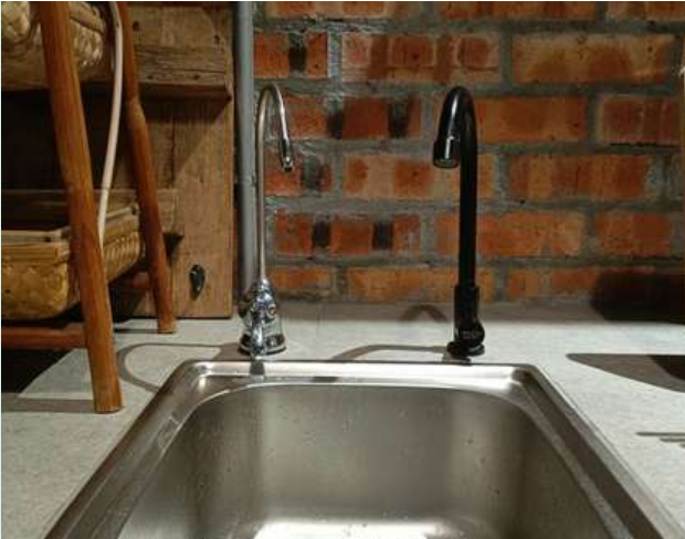
Filtered water from silver tap