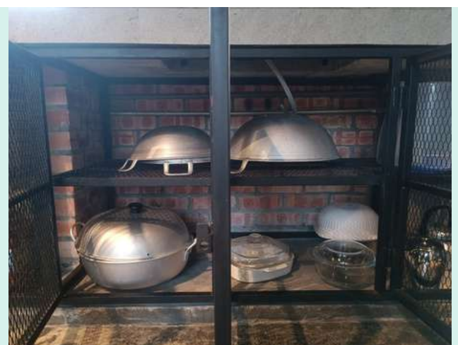
Curry/ Soup/ Goreng Kual