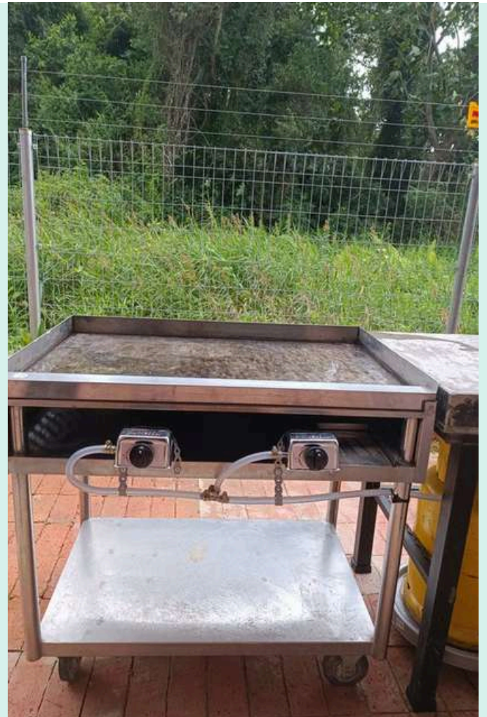
Gas barbecue with Hot Surface. Please clean before use.