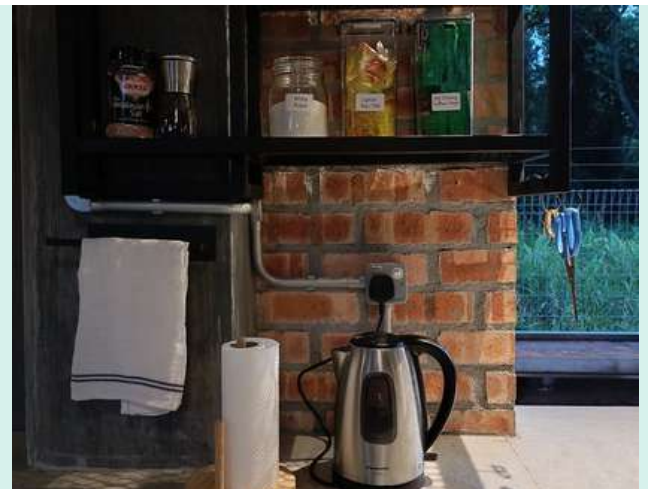
Self Service Breakfast Tea/Coffee